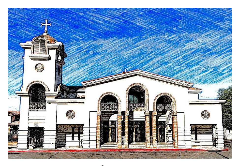
July 24, 2022 6th Sunday of Matthew