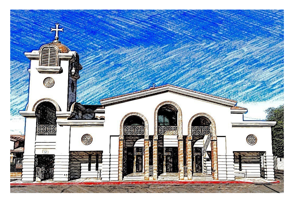
August 7, 2022 8th Sunday of Matthew