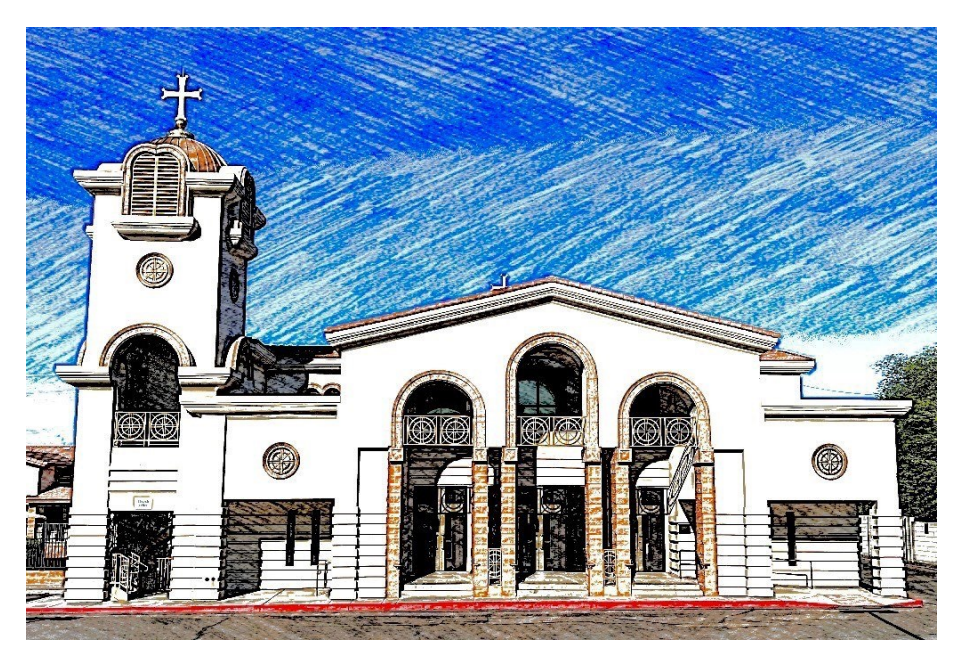
December 4, 2022 10th Sunday of Luke