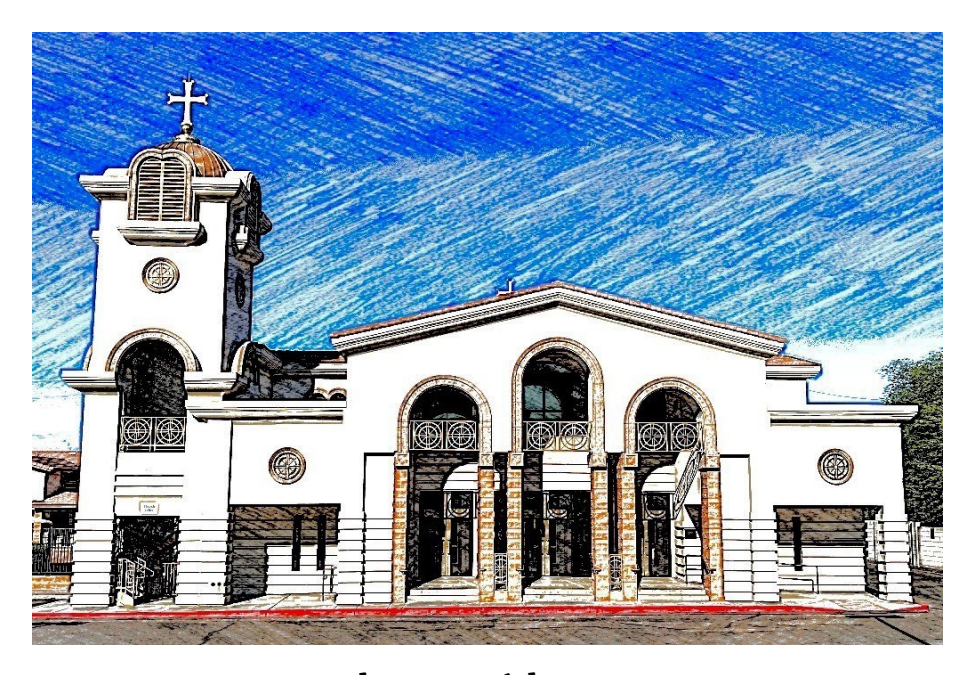
February 26th, 2023 Forgiveness Sunday, Cheesefare Sunday